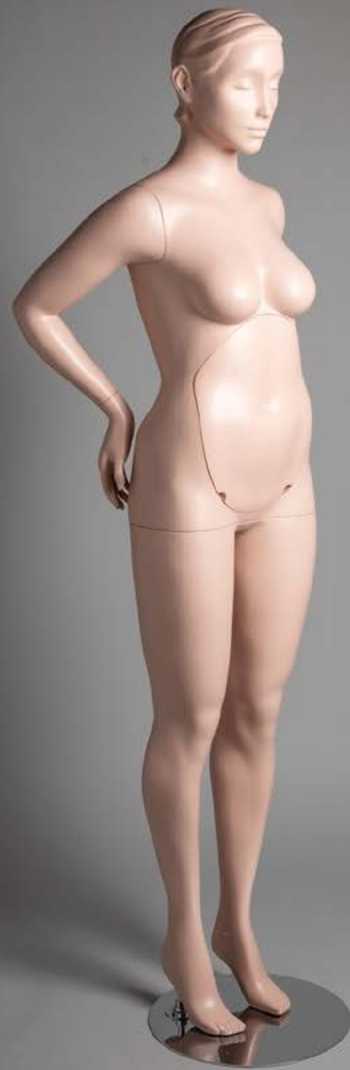
ORIGINAL SIZE 8

We premiered maternity figures, designed to represent any trimester during pregnancy. With 4 different bump options, lightweight magnetic belly molds can be easily changed. The convertible mannequin is available in two poses as well as a simple 3/4 form.